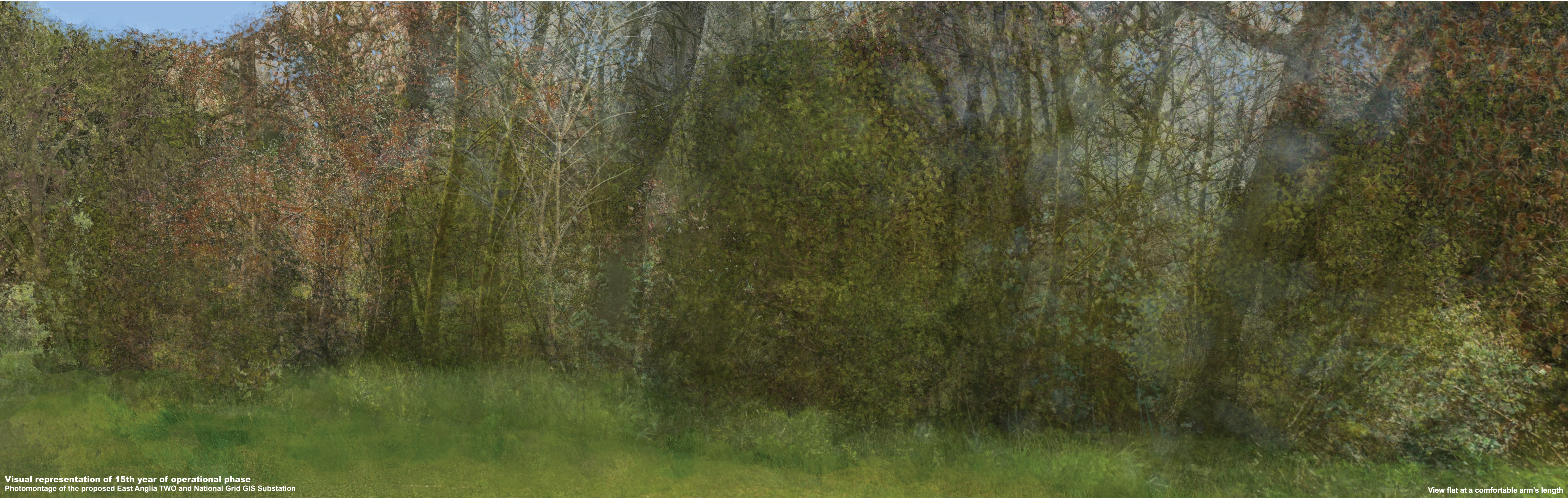
Visual representation of 15th year of operational phase Photomontage of the proposed East Anglia TWO and National Grid GIS Substation