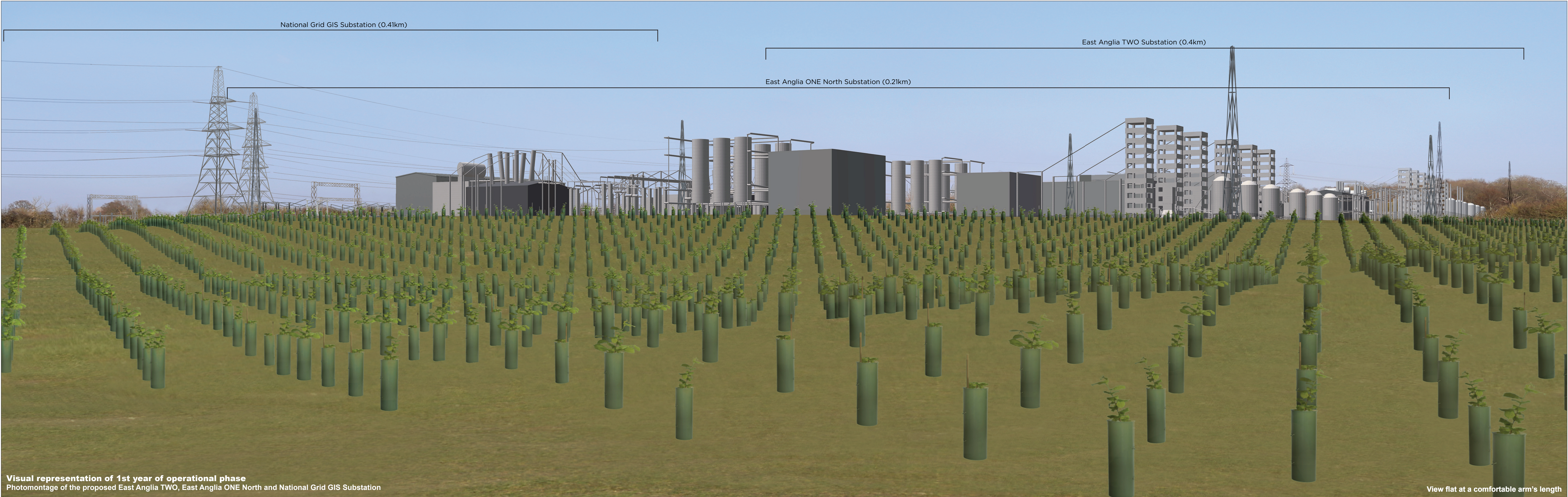
Visual representation of 1st year of operational phase Photomontage of the proposed East Anglia TWO, East Anglia ONE North and National Grid GIS Substation